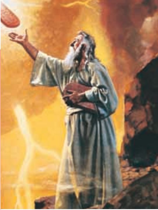
An artists impression of Moses receiving the Ten Commandments from God on Mt. Sinai. On these two tables of stone were written the Law of God, the Divine Constitution for the Nation of Israel and for all Christians in future generations.

studied the subject of the sanctuary, they had come to understand the Saviour's change of ministration, and they saw that he was now officiating before the ark of God, pleading his blood in behalf of sinners.