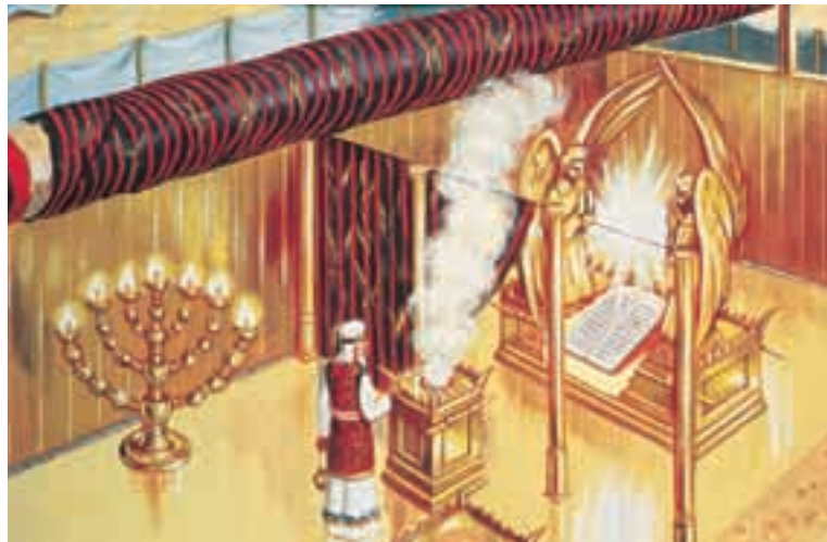
The Original Sanctuary built by Moses. The services and style of worship symbolised the plan of salvation.

In the very bosom of the decalogue is the fourth commandment, as it was first