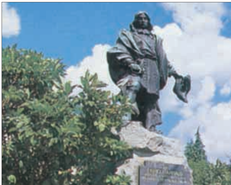
Statue of Enrico Arnaud: Under the Duke of Savoy the Waldenses were exiled to Geneva in 1686. Unfortunately, the knowledge and doctrines of the primitive church and their Sabbath were lost in the years of persecution.

churches accept a sabbath of her creating, while they reject the Bible Sabbath, they virtually admit this assumption. They may claim the authority of tradition and of the Fathers for the change; but in so doing they ignore the very principle which separates them from Rome,—that “the Bible, and the Bible only, is the religion of Protestants.” The papist can see that they are deceiving themselves, willingly closing their eyes to the facts in the case. As the movement for Sunday enforcement gains