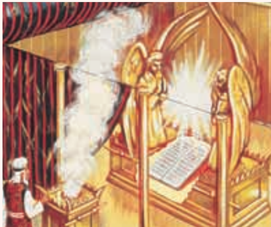
The Ark of the Covenant in which was placed the Ten Commandments, after Moses had received them on Mt. Sinai.

sanctuary. Therefore the announcement that the temple of God was opened in